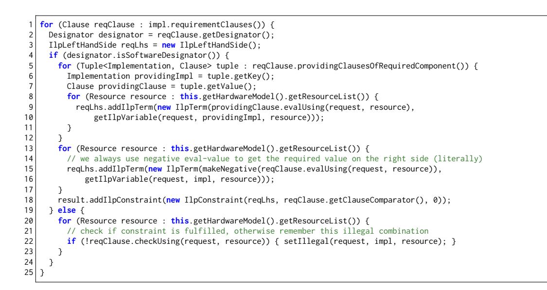
Figure 3: Negotiation constraint computation